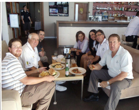
"Spot the hungriest members" competition