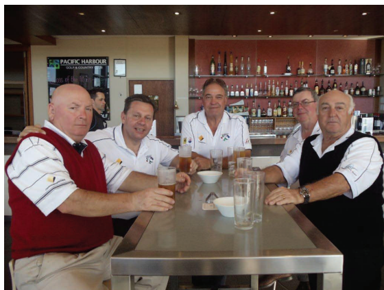
"Spot the slowest drinkers" competition