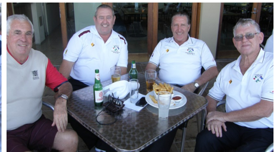
Relaxing, enjoying and reminiscing on the day's events