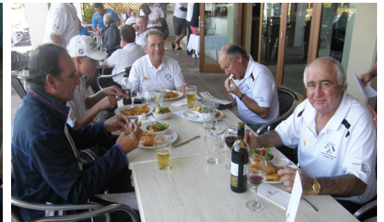
The working group re-filling the tanks