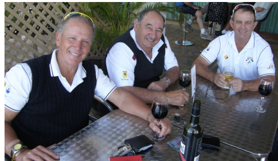
Spot the two halos