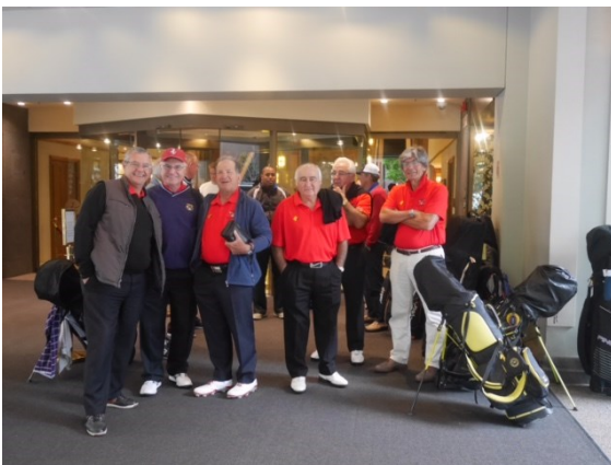
Some of the Langham Hotel residents eagerly awaiting the bus on Sunday morning