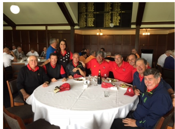
Some more keen golfers at lunch not realising what was awaiting them outside